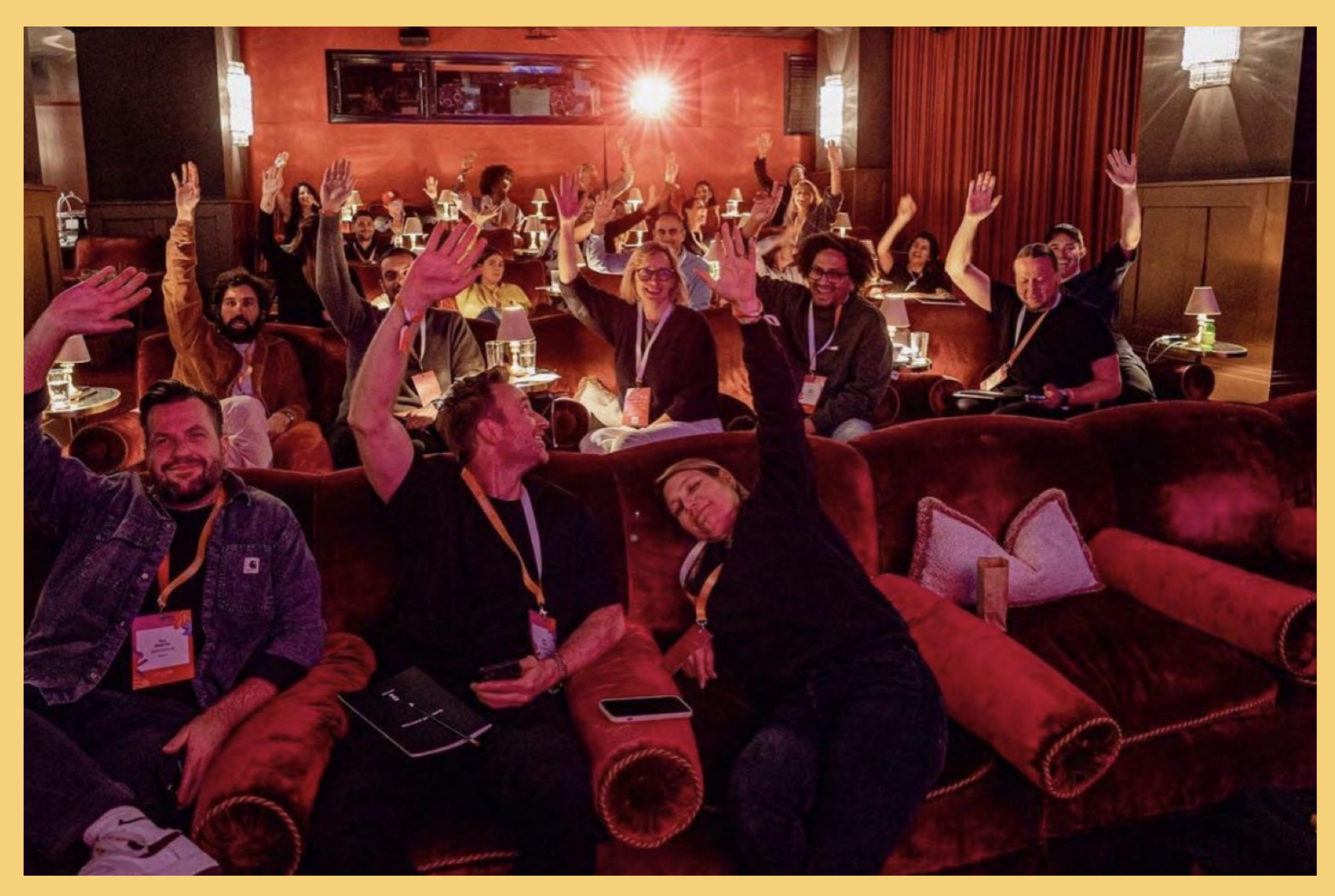
In 2025, CICLOPE's judging process will consist of three rounds.

The first round is undertaken by the Grand Jury and Executive Jury, who will watch and rank the entries on CICLOPE's online platform. The highest-ranked entries in each category will be considered Finalists.