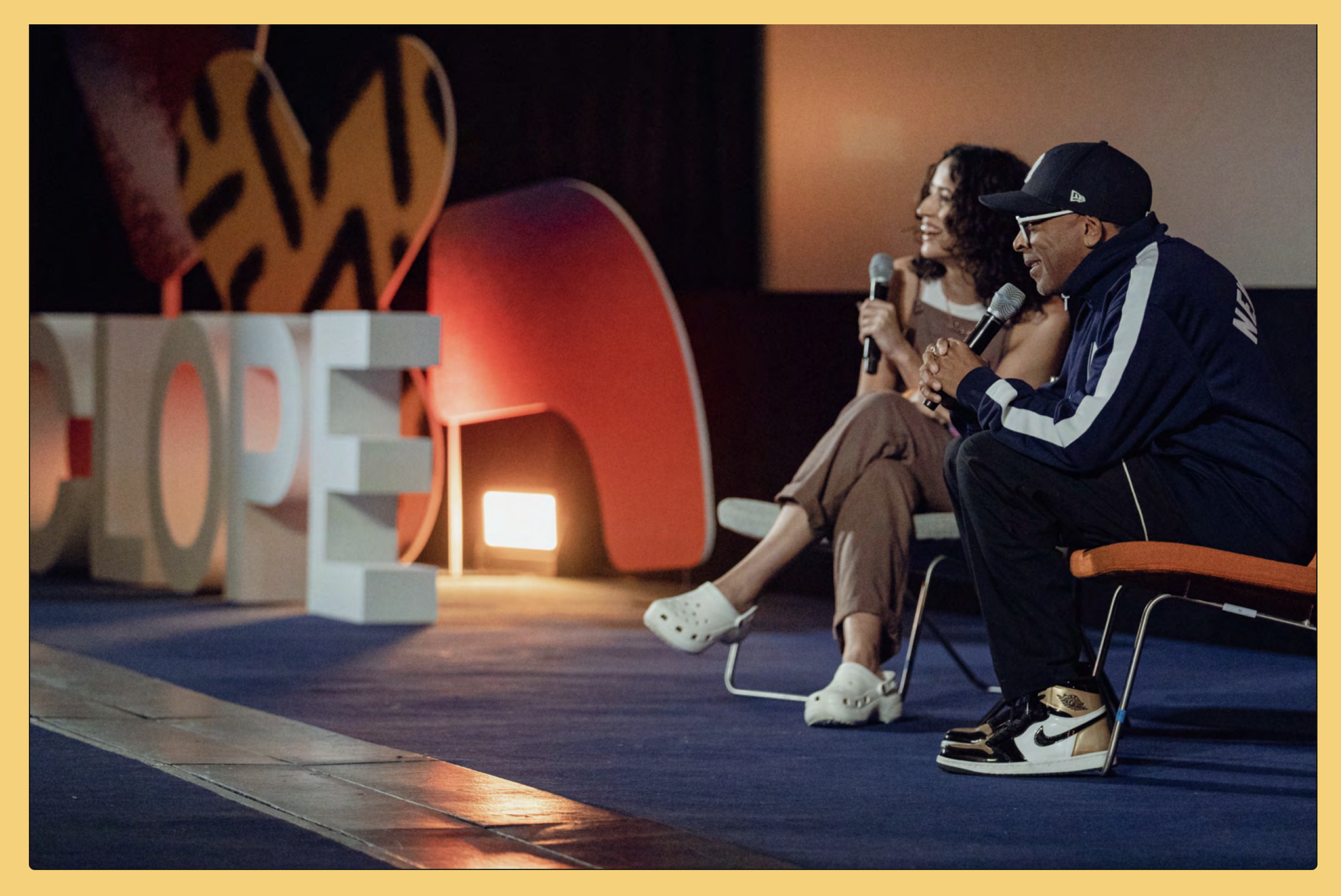
CICLOPE is home to those who believe in the power of craft.

A platform for the global creative community within the advertising and entertainment industries to gather and be inspired, elevate their work and drive positive change.