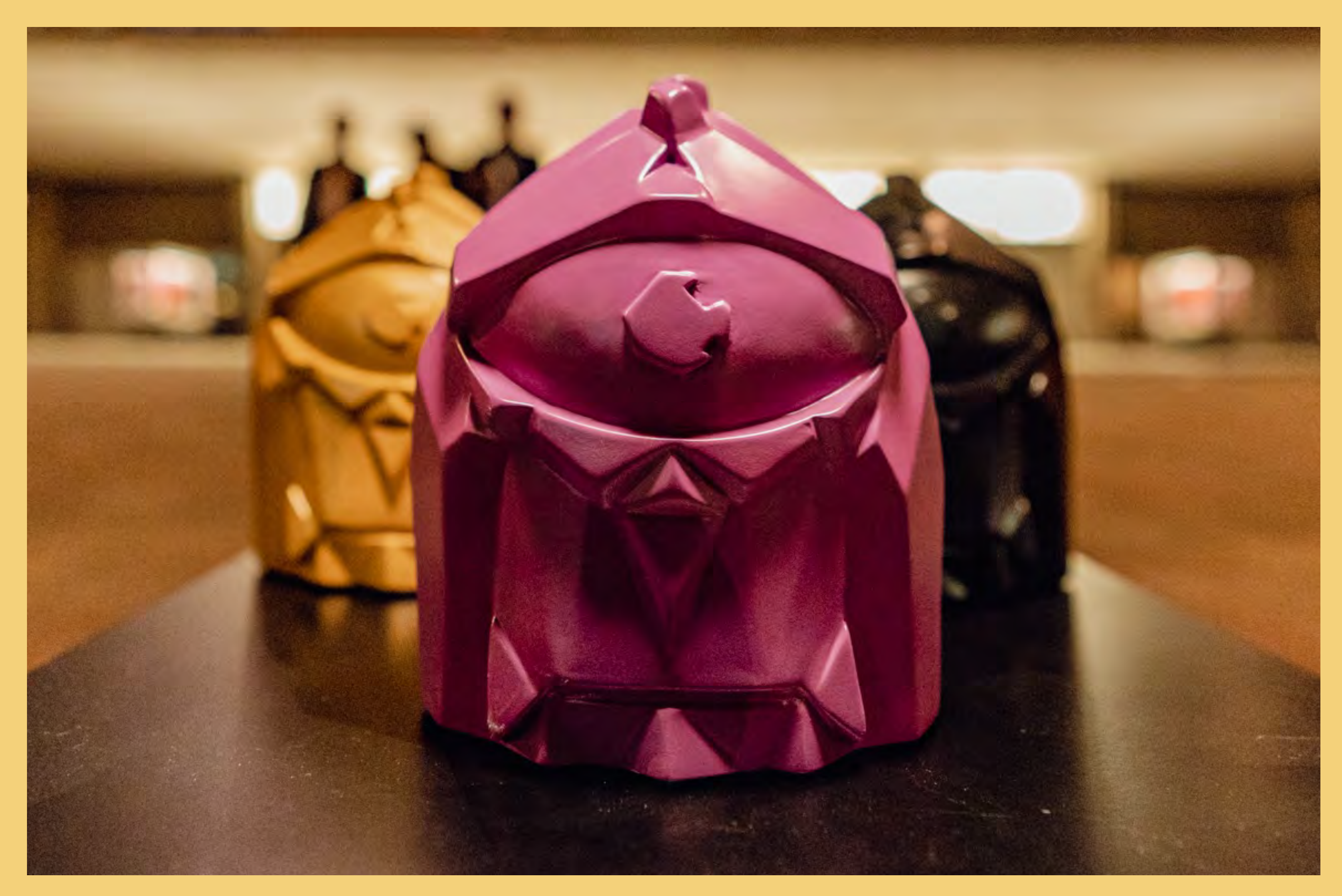
CICLOPE Award is the ultimate benchmark of excellence in craft.

The industry award dedicated to honoring the people behind the craft across film, advertising, and digital production, the CICLOPE Award is an annual celebration of the very best of the year's commercials, music videos and short films.